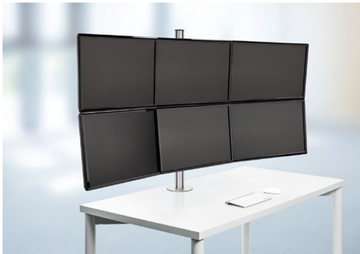
NOVUS TSS monitor holder Sextett telescope