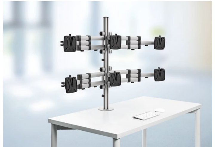
NOVUS TSS monitor holder Sextett telescope